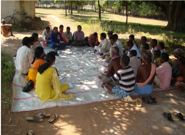
Expertise, Experience and Facilities of WOSCA for Promotion of SHGs